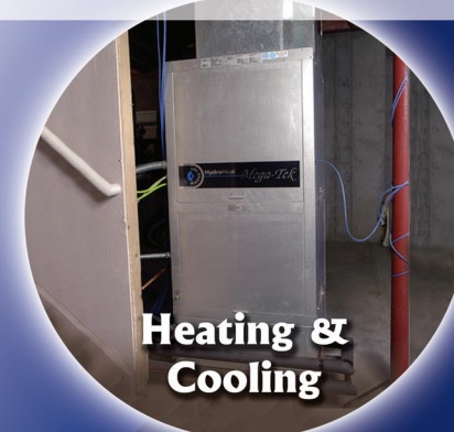
Heating & Cooling